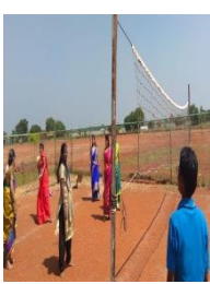
In the Ground