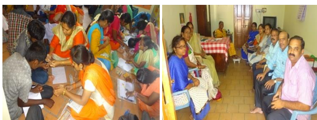
Field Trip - Avvai Ashram, Ambasamudhram

Celebrating Dr. Maria Montessori's birthday