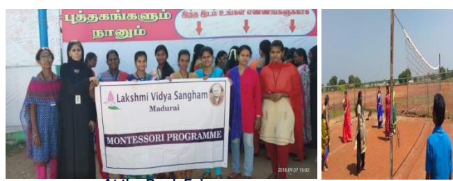
At the Book Fair